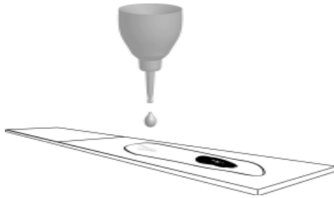
Fig. 1 Apply one to four drops (or more) of Histo AquaMount™ Mounting Medium on the slide at the end and / or over the tissue.